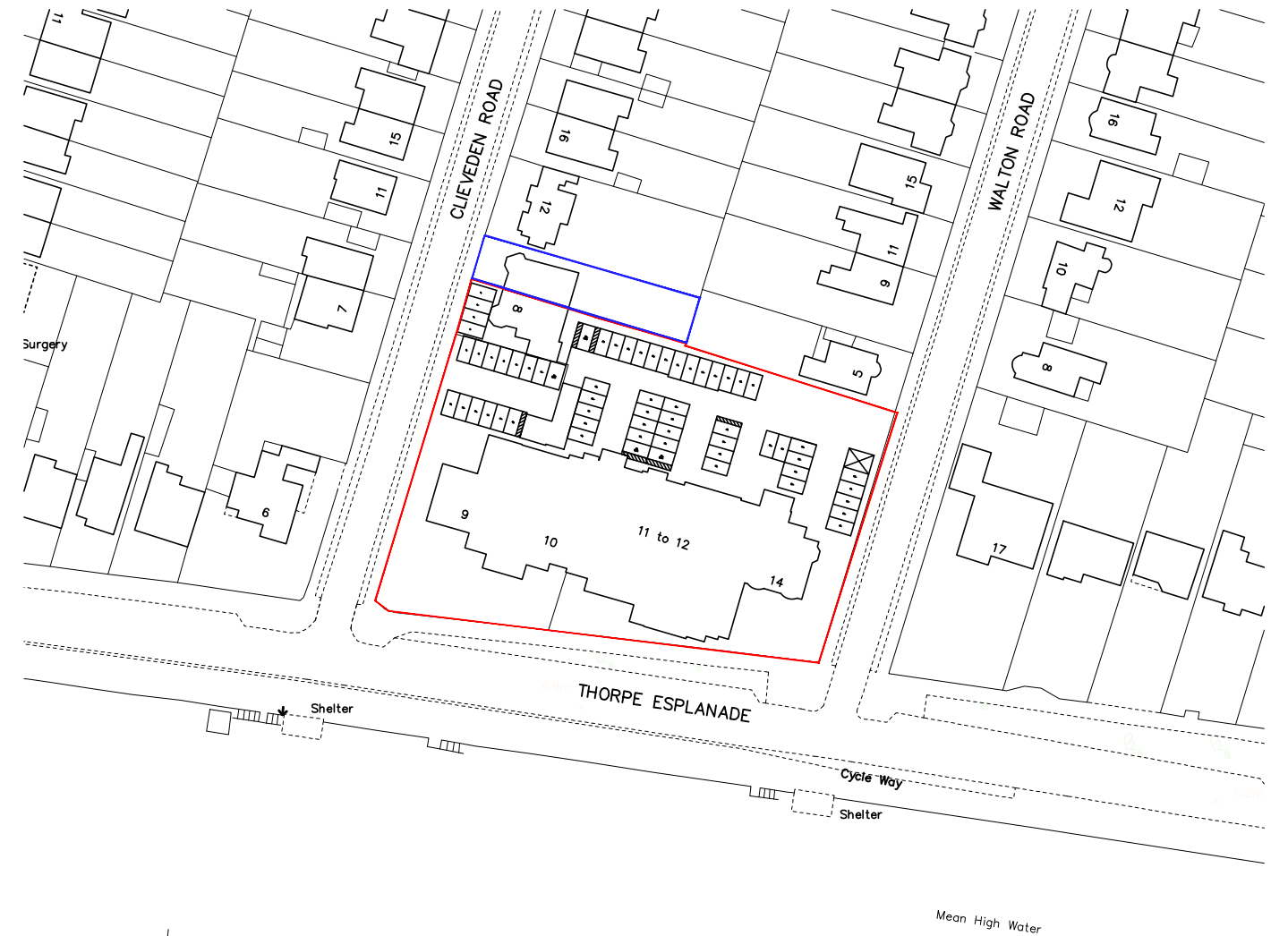
1 Proposed Location Plan