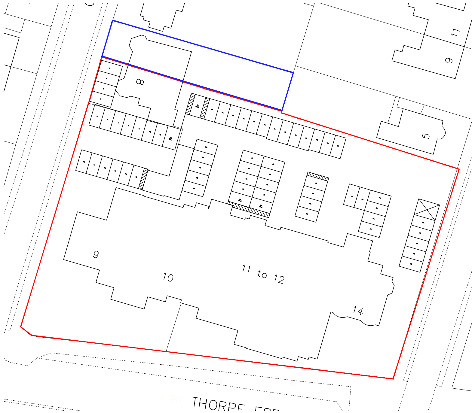
2 Proposed Site Plan

Do not scale this drawing. Work to figured dimensions only. This drawing is copyright of APS Designs and should only be reproduced with their express permission. Check all dimensions on site. Any discrepancies should be reported to APS Designs prior to commencement.